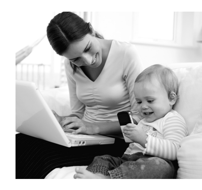
Use BAM while you're on the go. Register or log in by going to bcbstx.com from your mobile device Web browser for secure and convenient access.